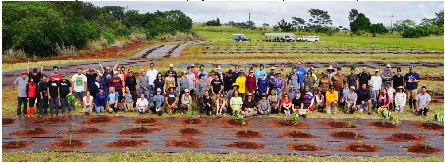
12.13.2k19 ... Following Protocol Ceremony onsite at State Monument Kūkaniloko Birthstones , the Hawaiian Civic Club of Wahiawā, Wahiawā and other community members, the Office of Hawaiian Affairs - OHA's 80 plus staff members, families and friends joined each other "to share the salt of our brows, and the salt off our backs" to plant 1,000 koa trees at Kūkaniloko. This area is located in the front 23 acres along Kamehameha Highway. The forest continues to begin...

12.13.2k19...Friday, December 13th, 2019 Lucky day for 1,000 koa trees planted onsite at kapaahuawa Kūkaniloko.